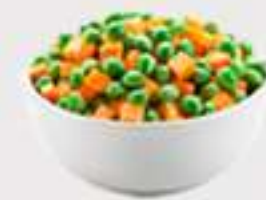
PEAS & CARROTS