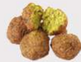
SEMI FRIED FALAFEL