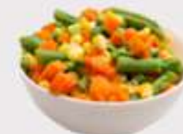
VEGETABLES FOR SOUP